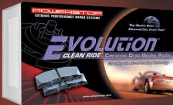
Evolution Clean Ride Ceramic Disc Brakes