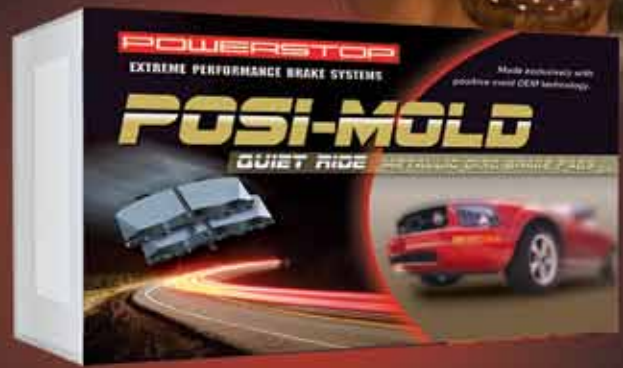
Posi-Mold Quiet Ride Metallic Disc Brakes