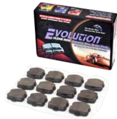
Z16 Evolution Brake Pad Set