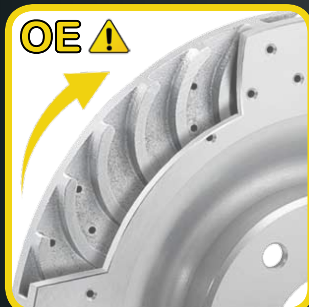
Right OE Rotor