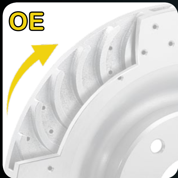
Left OE Rotor