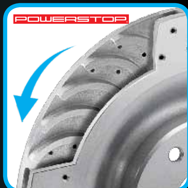
Right Power Stop Rotor