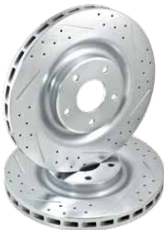
Z06 Drilled & Slotted Rotors