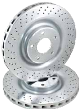
Z06 Drilled Rotors