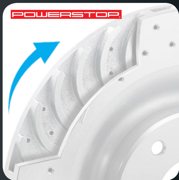
Left Power Stop Rotor